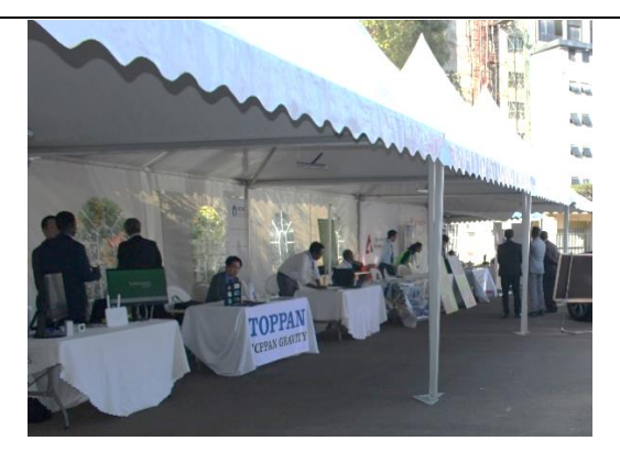
Japanese Company and NGO Exhibition Booths