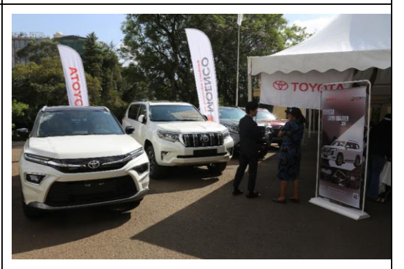
Exhibition of Japanese brand vehicles